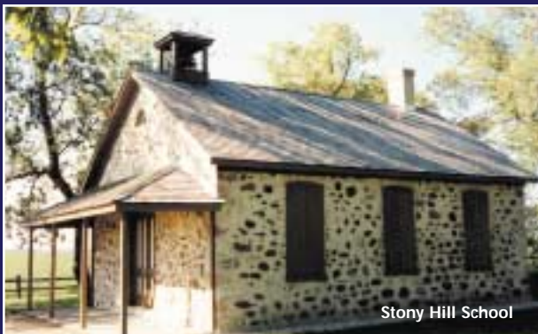
Stony Hill School